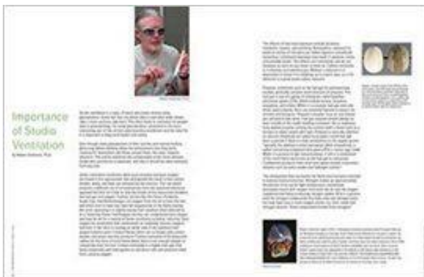
Science & Safety — Glass