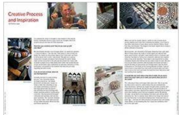
Artist Insights — Glass