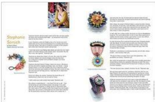
Artist Spotlight — Glass + Medium