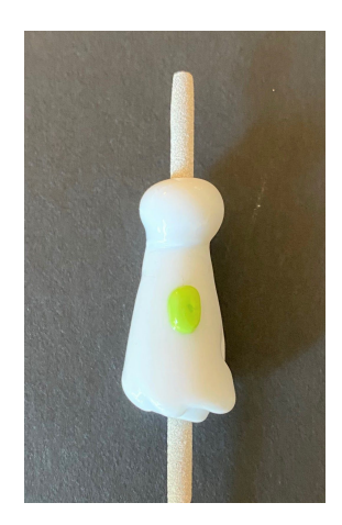
Step 4: When you have shaped your ghost body and ruffle edge....it is time to add a small pea green dot or stripe for the pumpkin stem. I like to shape these into a slight rectangle shape with my knife or pointed tweezers.