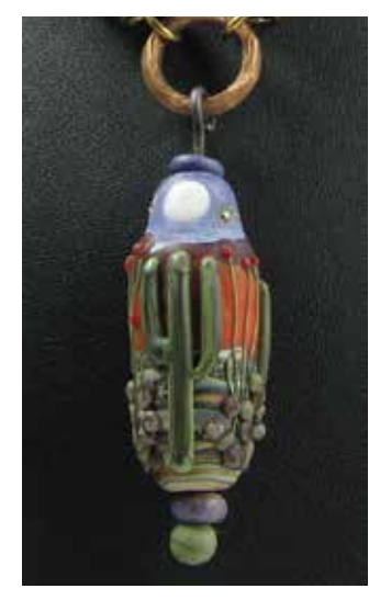
Diane Sepansky pendant

Mail to: 304 W. Main Street Suite 2 #114 Avon, CT 06001