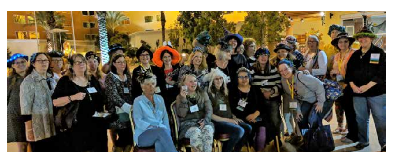
Glass Hats 2019