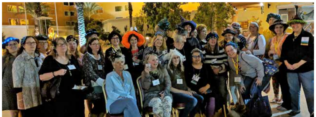
Glass Hats 2019