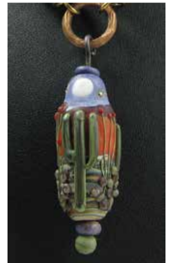
Diane Sepansky pendant

Mail to: 304 W. Main Street Suite 2 #114 Avon, CT 06001