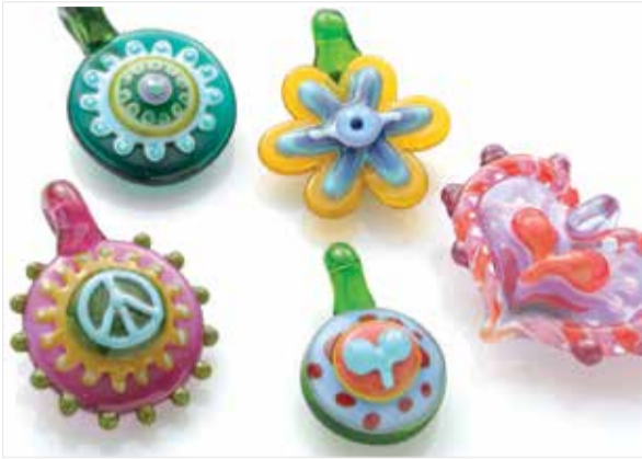
Stephanie Sersich pendants

As a maker, when you think about lampworking, what stirs your soul and ignites your passion? Is it a unique color combination? Perhaps a specific form or textural element? Maybe a captivating style or special process you use? Artists are encouraged to challenge themselves and submit pendant pieces that embody their personal voice — expressions that highlight the infinite possibilities in contemporary glass beadmaking and radiate from within their work. Whether you are a novice beadmaker or have years of experience, we invite you to create your favorite design and show us what ignites your lamp work bead passion! This exhibit will be on display in conjunction with the 2020 Gathering in Las Vegas. Open to all ISGB members.