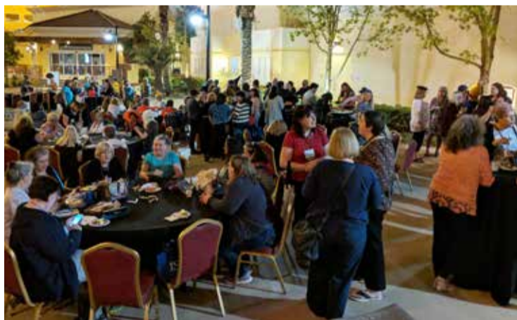
Opening Reception 2019

Bring beads of any size or shape to donate to Beads of Courage. The preferred hole size is 3/32" and larger, but 1/16" holes will be accepted. Do not use reduction glass, frits, powders, or enamels that leave a metallic surface on the beads. The inside of the bead should be free of bead release and there should be no sharp corners, sharp edges on the bead holes, cracks or protrusions that would easily break off, including hearts with long, delicate tails. Beads must be fully kiln-annealed. Please remember that these beads are worn and handled by children and should be sturdy enough to stand up to wear and tear.